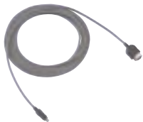
CCFD-3L (4-pin to 6-pin with lock) CCF-3L (6-pin to 6-pin with lock) i.LINK Cable