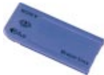
MSA-4A/8A/16A/32A/64A IC Recording Media Memory Stick