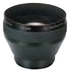
VCL-HG1758 Tele Conversion Lens 1.7x