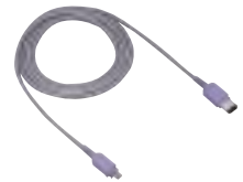
VMC-IL4615/4635 (4-pin to 6-pin) VMC-IL6615/6635 (6-pin to 6-pin) i.LINK Cable